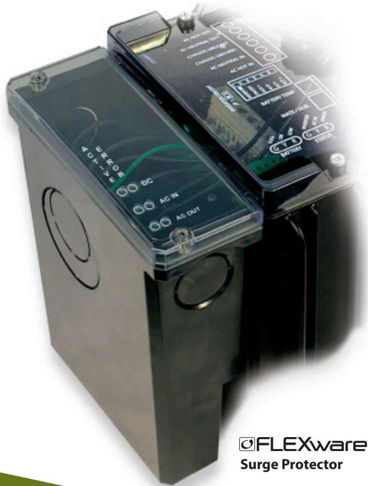
FLEXware™ Surge Protector

OutBack Power’s FLEXware Surge Protector is a seamlessly integrated balance-of-system component for the FX Series Inverter/Charger. The FLEXware Surge Protector was designed by OutBack Power engineers specifically for OutBack FX Series Inverter/Chargers, and provides multiple levels of protection for the vital electrical components of the Inverter/Charger in the event of an electrical surge. The sophisticated design allows for both AC and DC protection on multiple circuits (two AC and one DC) via thermally fused Metal Oxide Varistors (MOVs). LED visual indicators provide at-a-glance status monitoring allowing system users to determine FLEXware Surge Protector operational status in real-time. The FLEXware Surge Protector is designed to operate between 120 to 240 VAC at 50/60 Hz and 12 to 48 VDC. Its multiple mounting configurations allow it to be incorporated into any OutBack Power system.