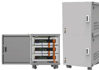
V-Box-IC hold up to 3°V5°, stack up to 6°V5°