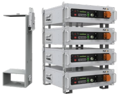
Brackets for V5° hold up to 1°V5°, stack up to 6°V5°