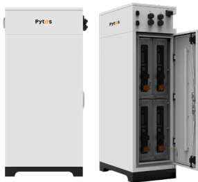
V-BOX-OC hold up to 4°V5°