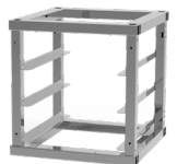
V-Box-IC se hold up to 3°V5°, stack up to 6°V5°