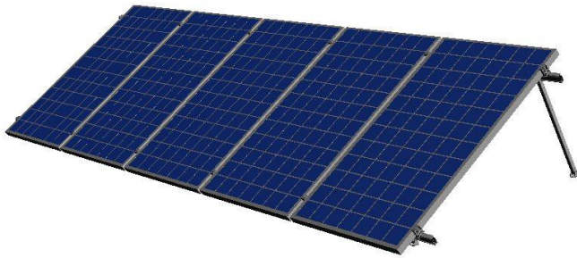
Figure 1: Low Profile Tilt

Description: There are 2 basic configurations in which modules can be mounted for tilted applications. The most common is referred to as "Low Profile Tilt" ( Figure 1 ) where rails run across the tilted modules. The other is "High Profile Tilt" ( Figure 2 ) where rails run up and down the tilted modules.