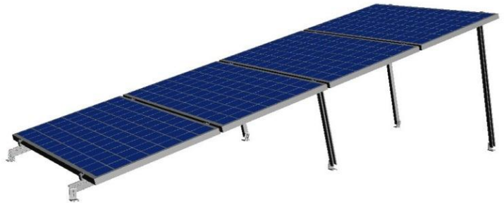
Figure 2: High Profile Tilt

SOLARMOUNT-E can be used for Low and High Profile Tilt applications on flat roofs (under 5° roof pitch) as well as flush to roof applications on pitched roofs. At the time of this writing, the SOLARMOUNT-E online configurator can address flush to roof applications on pitched roofs or Low Profile Tilt applications on flat roofs.